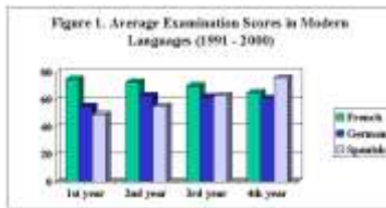
Bar Chart / line chart Table