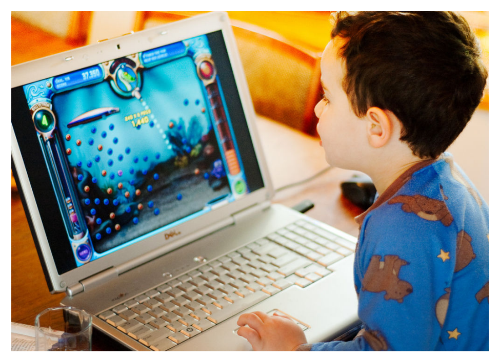
Improving Logical thinking or playing violent game? This leaflet shows you how to spot the difference

The facts and well researched guidance without the techno-babble!